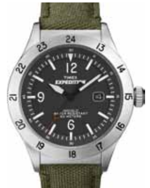
T49880 • $149.00 NEW