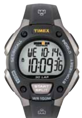
T5E901 • $149.00