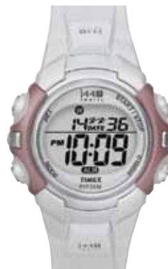
T5G881 • $79.00