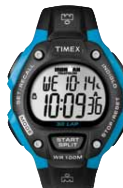
T5K521 • $149.00