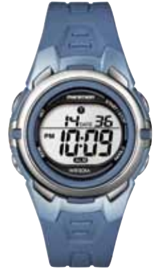
T5K362 • $79.00