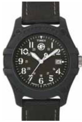
T49689 • $99.00