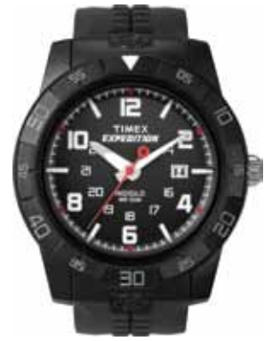
T49831 • $129.00