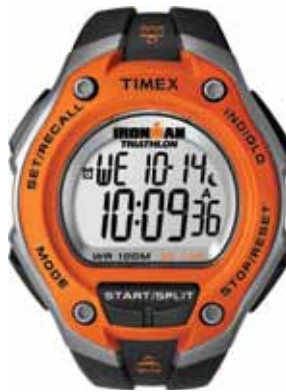
T5K529 • $149.00