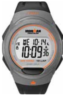
T5K607 • $119.00 NEW