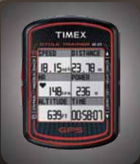
GPS BIKE COMPUTER W/ HR T5K615 • $399.00