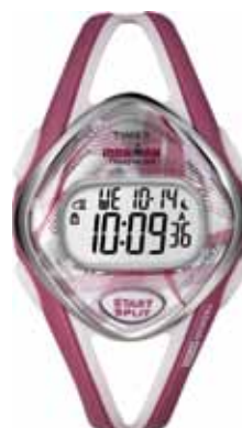
T5K510 • $159.00