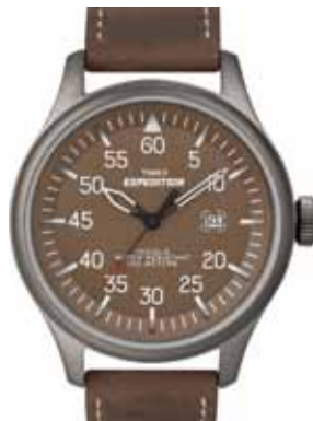
T49874 • $159.00 NEW