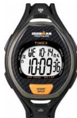
T5K335 • $159.00