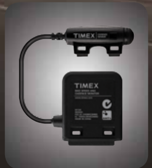
BIKE SPEED & CADENCE SENSOR Optional accessory sold separately T5K445 • $69.00