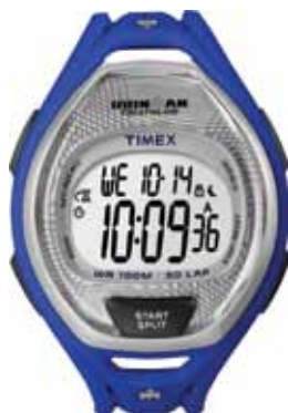
T5K511 • $159.00