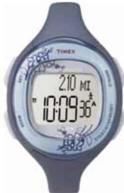
T5K484 • $149.00