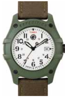
T49690 • $99.00