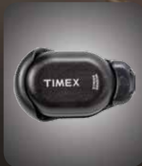
ANT+ FOOT POD SENSOR Optional accessory sold separately T5K573 • $99.00