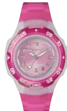
T5K367 • $79.00