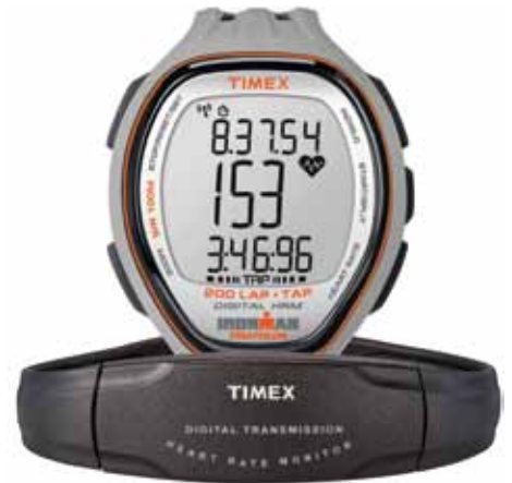
T5K546 • $299.00