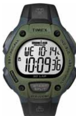
T5K520 • $149.00