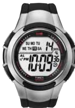
T5K237 • $89.00