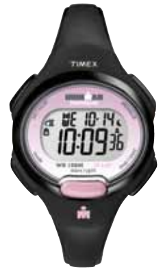
T5K522 • $119.00