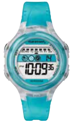
T5K428 • $79.00