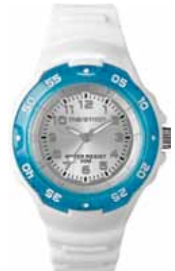
T5K504 • $79.00