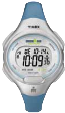
T5K604 • $119.00 NEW