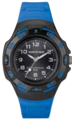
T5K579 • $79.00