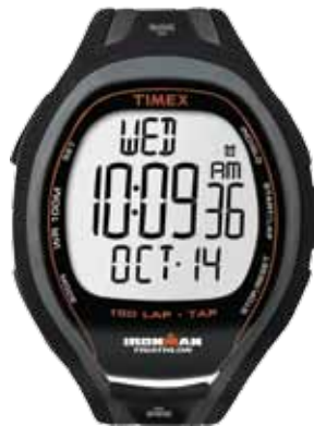
T5K253 • $199.00