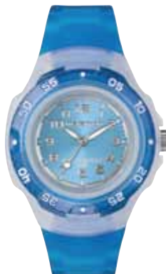
T5K365 • $79.00