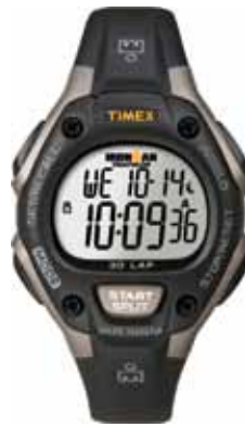
T5E961 • $139.00