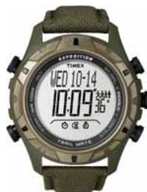
T49846 • $179.00