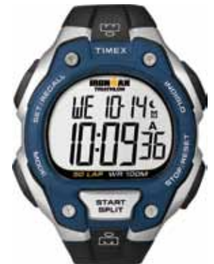
T5K496 • $179.00