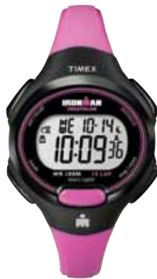
T5K525 • $119.00