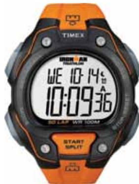
T5K493 • $179.00