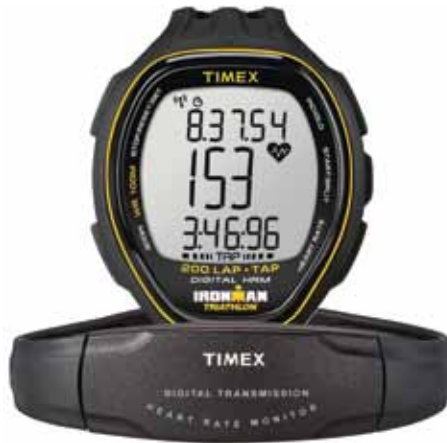
T5K545 • $299.00