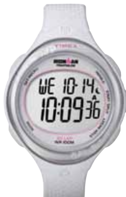
T5K601 • $149.00 NEW