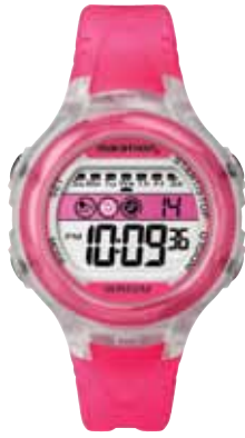
T5K425 • $79.00