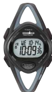
T5K039 • $159.00