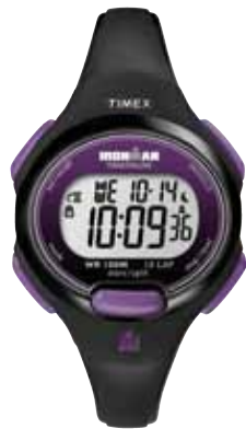
T5K523 • $119.00