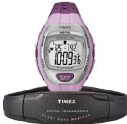
T5K627 • $249.00 NEW