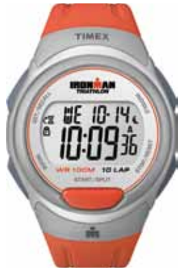
T5K611 • $119.00 NEW