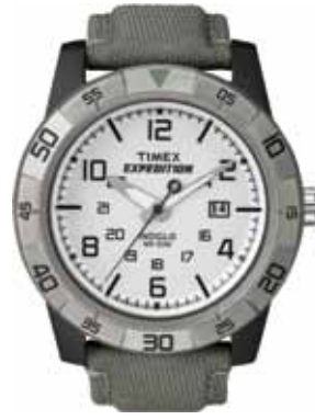
T49864 • $119.00