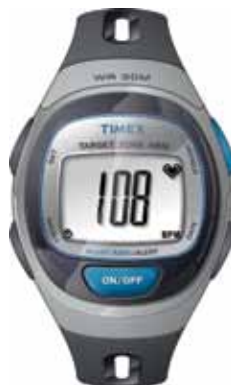
T5K541 • $169.00