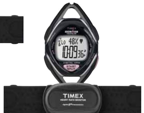
T5K570 • $399.00