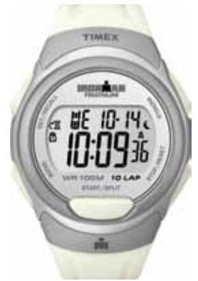
T5K609 • $119.00 NEW