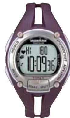
T5K213 • $299.00