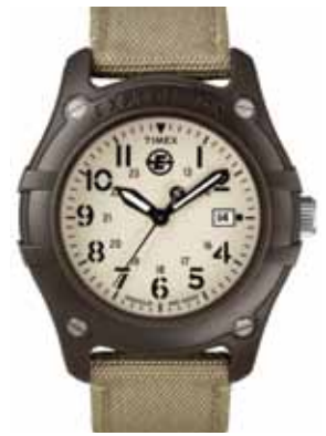
T49777 • $99.00