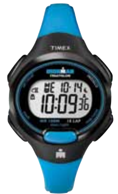
T5K526 • $119.00