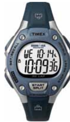
T5K409 • $139.00