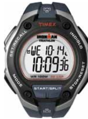
T5K416 • $149.00