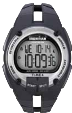
T5K155 • $159.00