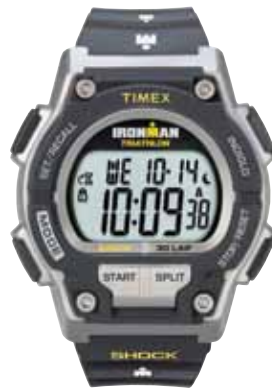
T5K195 • $179.00