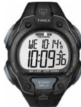
T5K495 • $179.00