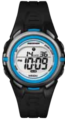
T5K518 • $79.00