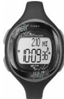
T5K486 • $149.00