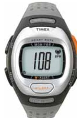
T5G971 • $169.00