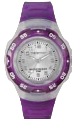
T5K503 • $79.00