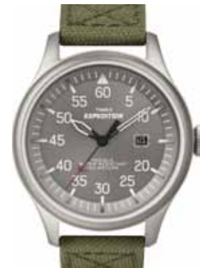
T49875 • $159.00 NEW