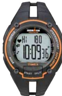
T5K212 • $299.00