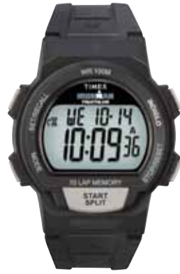
T5K170 • $119.00