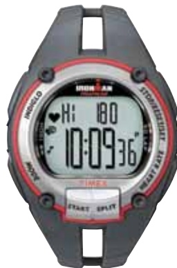
T5K211 • $299.00