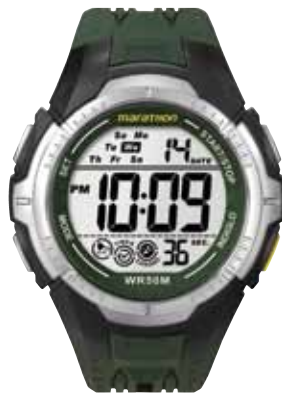
T5K516 • $89.00