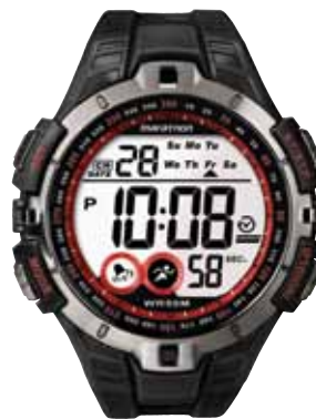
T5K423 • $89.00