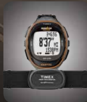
RUN TRAINER GPS HRM ORG/BLK T5K575 • $459.00