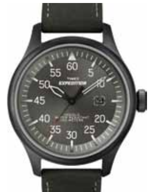
T49877 • $159.00 NEW