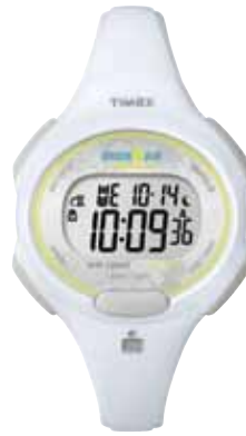
T5K606 • $119.00 NEW