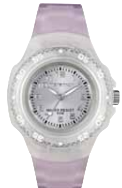
T5K368 • $79.00