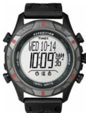
T49845 • $179.00