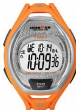
T5K512 • $159.00