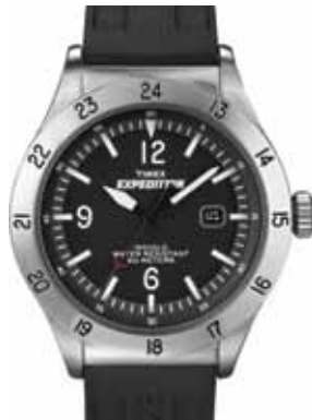
T49878 • $149.00 NEW