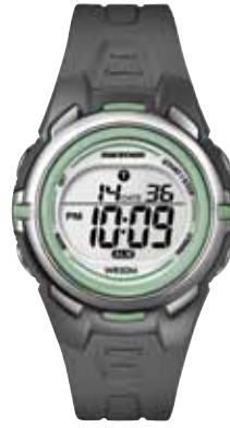
T5K519 • $79.00