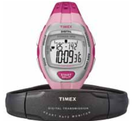
T5K628 • $249.00 NEW