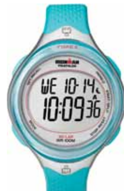
T5K602 • $149.00 NEW