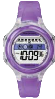
T5K427 • $79.00