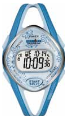
T5K509 • $159.00