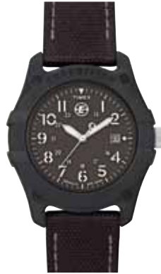
T49692 • $99.00