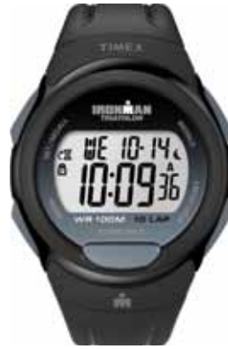
T5K608 • $119.00 NEW