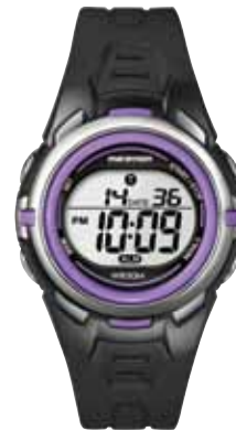
T5K364 • $79.00