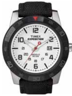
T49863 • $119.00