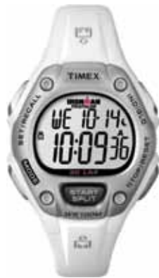
T5K515 • $139.00