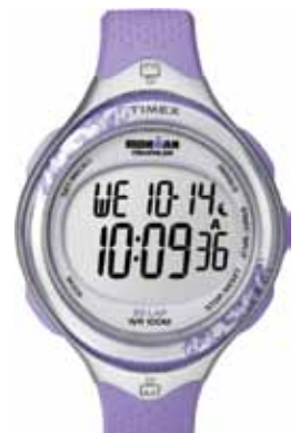
T5K603 • $149.00 NEW