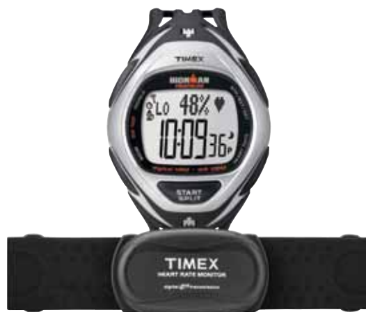
T5K568 • $399.00