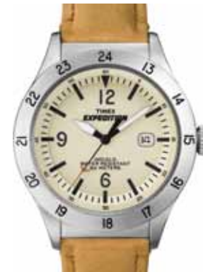
T49879 • $149.00 NEW