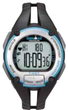
T5K214 • $299.00