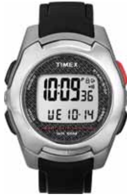
T5K470 • $199.00