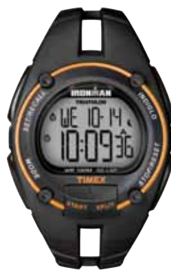
T5K156 • $159.00