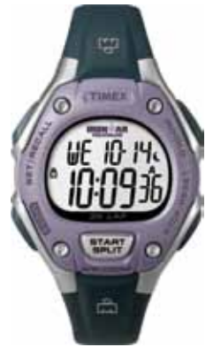
T5K410 • $139.00