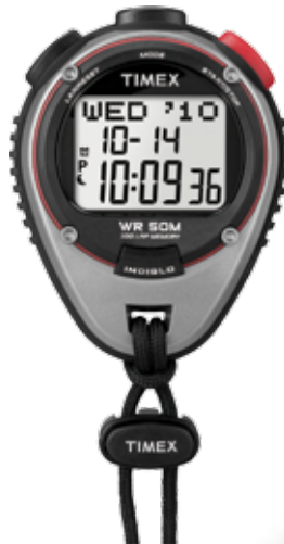
T5K491 • $129.00