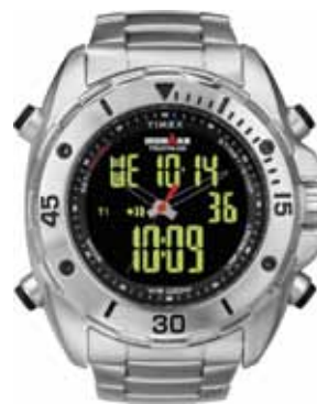
T5K406 • $299.00