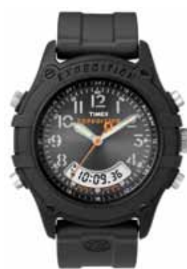
T49742 • $199.00