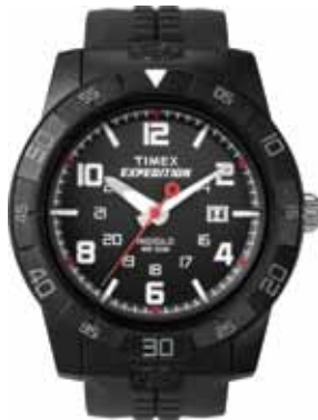
T49831 • $129.00