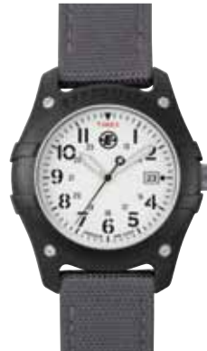
T49693 • $99.00