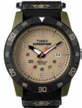
T49833 • $119.00