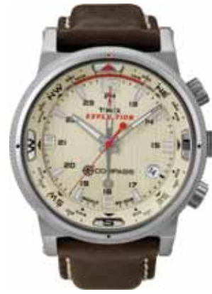
T49818 • $299.00