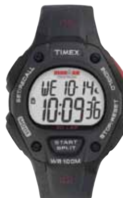
T5H581 • $159.00