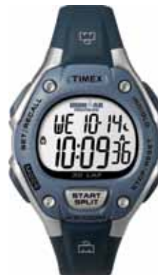
T5K409 • $139.00