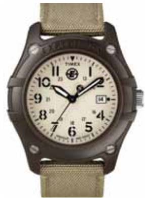
T49777 • $99.00