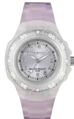
T5K368 • $79.00