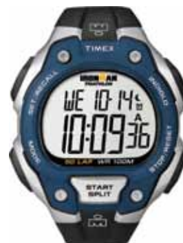
T5K496 • $179.00 NEW