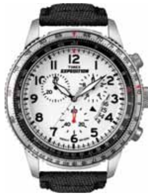
T49824 • $299.00