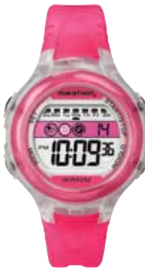
T5K425 • $79.00