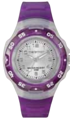
T5K503 • $79.00 NEW