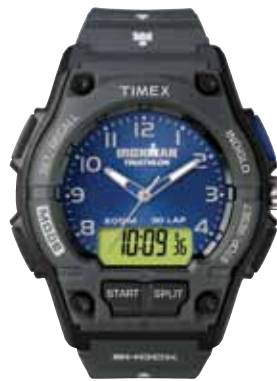
T5K398 • $199.00