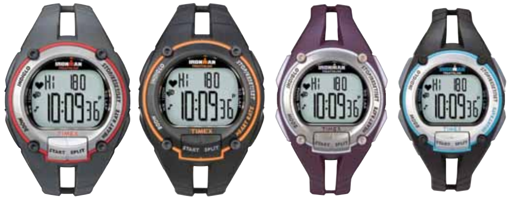
T5K211 • $299.00