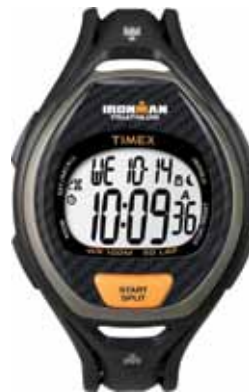
T5K335 • $159.00