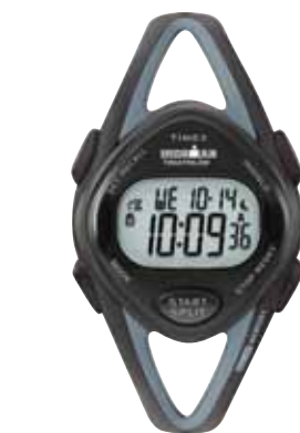
T5K039 • $169.00