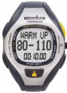
T5F001 • $399.00