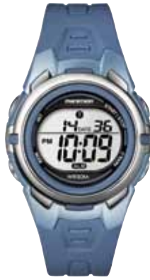
T5K362 • $79.00