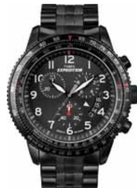
T49825 • $399.00