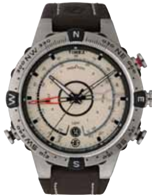
T45601 • $379.00