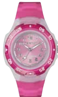
T5K367 • $79.00