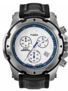
T49781 • $299.00