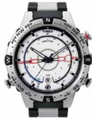
T45781 • $399.00