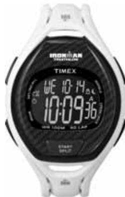
T5K339 • $159.00