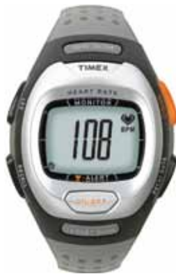
T5G971 • $169.00