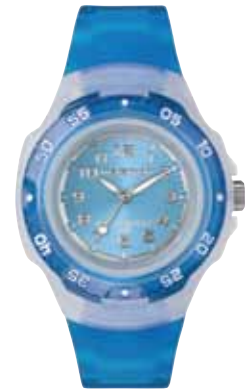
T5K365 • $79.00