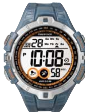
T5K424 • $89.00