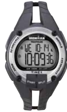
T5K159 • $159.00