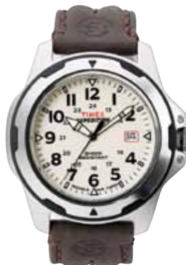
T49261 • $169.00