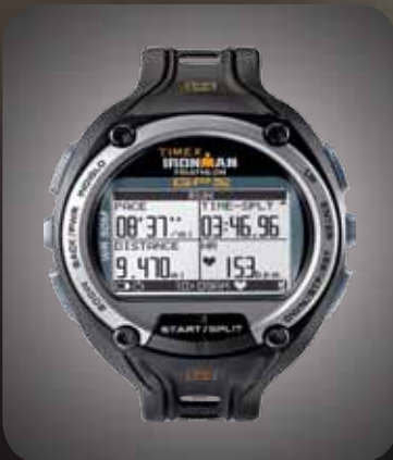
GLOBAL TRAINER™ WATCH T5K267 • $399.00