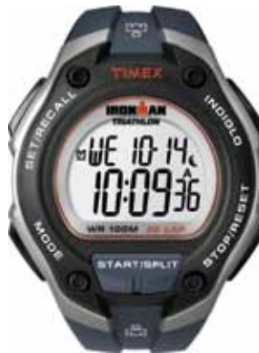
T5K416 • $149.00