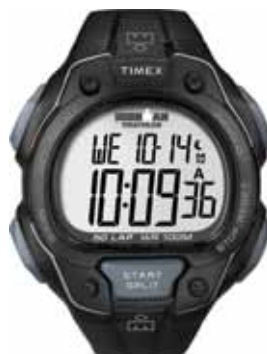
T5K495 • $179.00 NEW