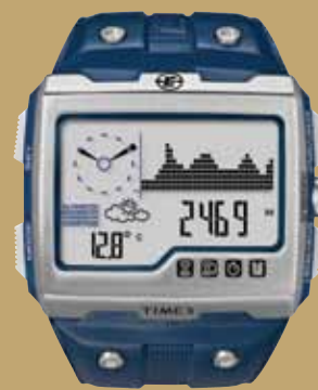
T49760 • $399.00