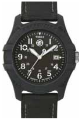
T49689 • $99.00