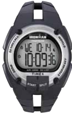
T5K155 • $159.00