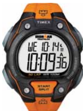
T5K493 • $179.00 NEW