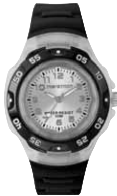
T5K502 • $79.00 NEW