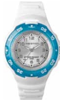
T5K504 • $79.00 NEW