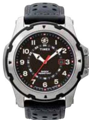
T49625 • $199.00