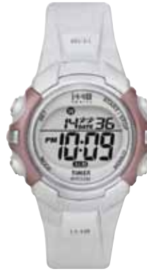
T5G881 • $79.00