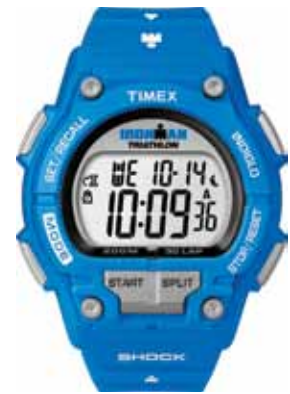
T5K433 • $179.00