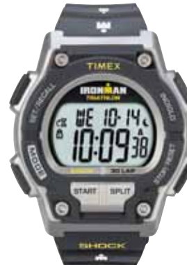
T5K195 • $179.00