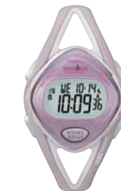
T5K027 • $169.00