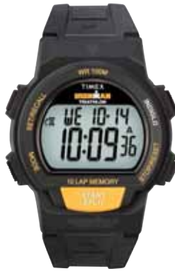
T5K169 • $119.00