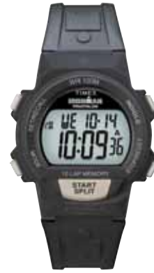
T5K174 • $119.00