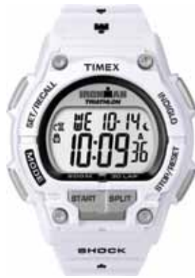
T5K429 • $179.00