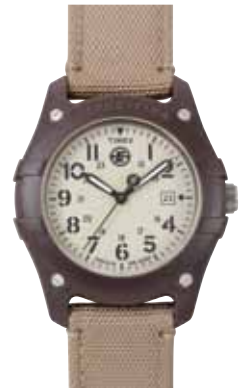
T49694 • $99.00