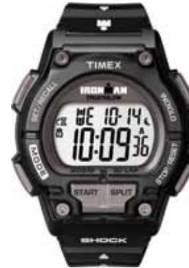
T5K478 • $179.00