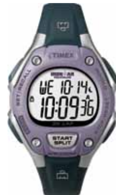
T5K410 • $139.00