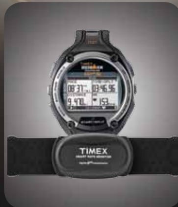
GLOBAL TRAINER™ WATCH WITH DIGITAL 2.4 HRM T5K444 • $459.00