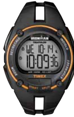
T5K156 • $159.00