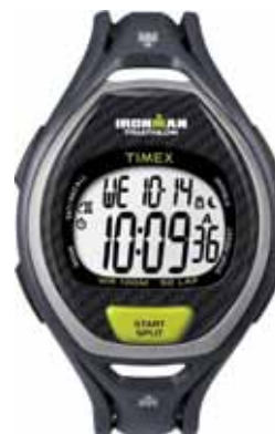
T5K340 • $159.00