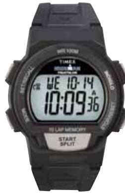
T5K170 • $119.00