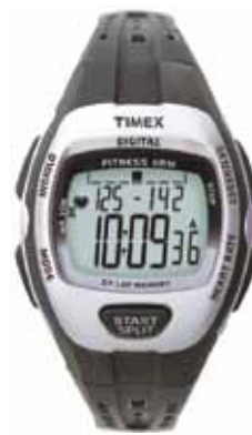
T5H881 • $259.00