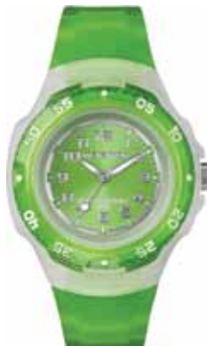
T5K366 • $79.00