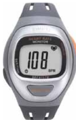
T5G941 • $129.00