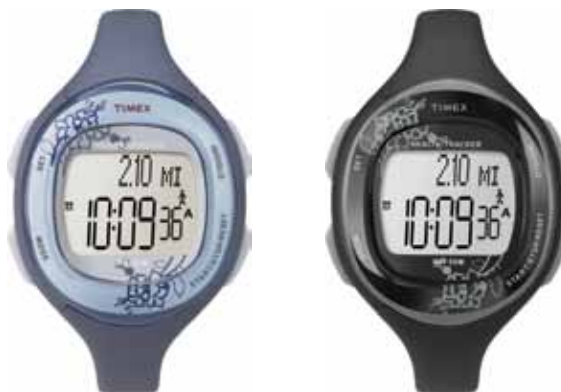
T5K484 • $149.00 NEW