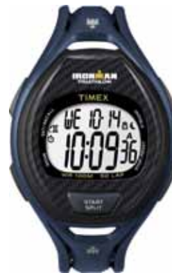
T5K337 • $159.00