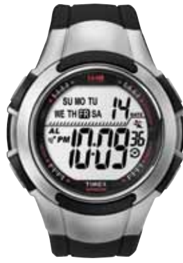
T5K237 • $89.00