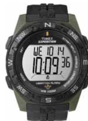
T49852 • $149.00