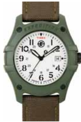
T49690 • $99.00