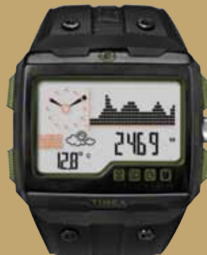
T49664 • $399.00