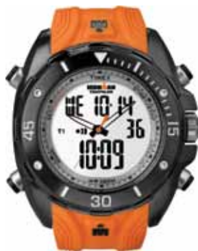
T5K403 • $249.00