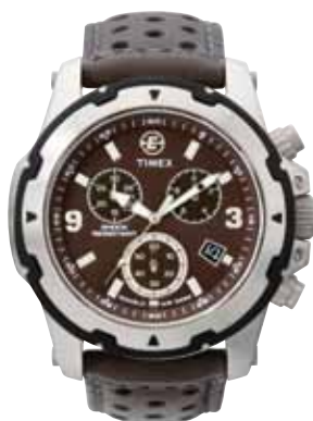
T49627 • $279.00