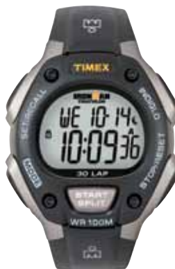
T5E901 • $159.00