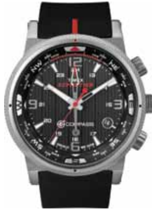
T49817 • $299.00