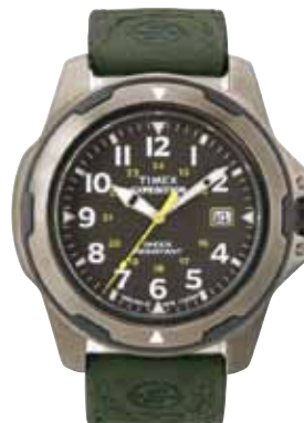
T49271 • $169.00