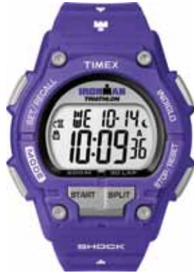
T5K431 • $179.00