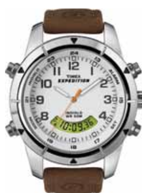
T49828 • $199.00