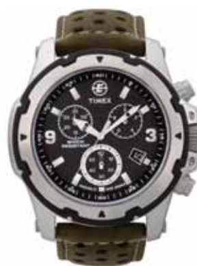
T49626 • $279.00