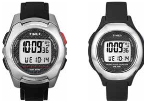
T5K470 • $199.00 NEW