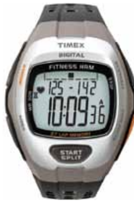
T5H911 • $259.00