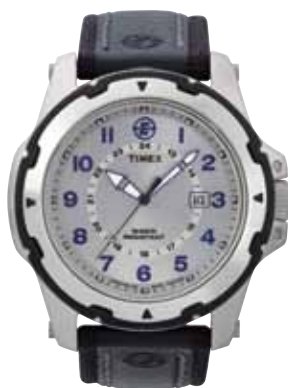
T49624 • $199.00