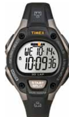
T5E961 • $139.00