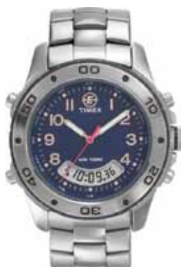
T45221 • $219.00