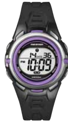
T5K364 • $79.00