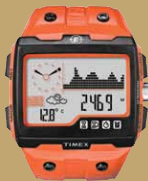
T49761 • $399.00