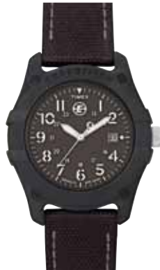
T49692 • $99.00