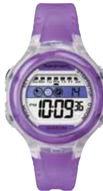
T5K427 • $79.00