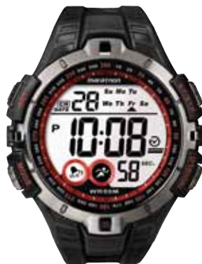
T5K423 • $89.00