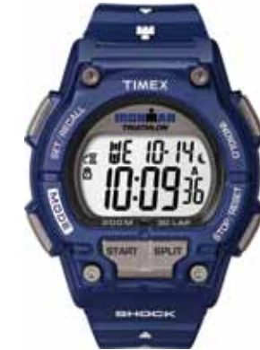
T5K476 • $179.00