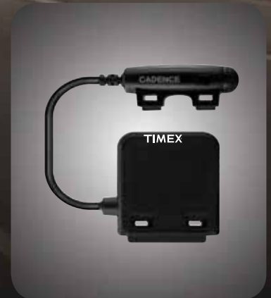
BIKE SPEED & CADENCE SENSOR Optional accessory sold separately T5K445 • $69.00