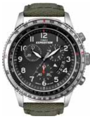
T49823 • $299.00