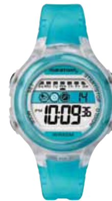
T5K428 • $79.00