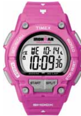
T5K432 • $179.00