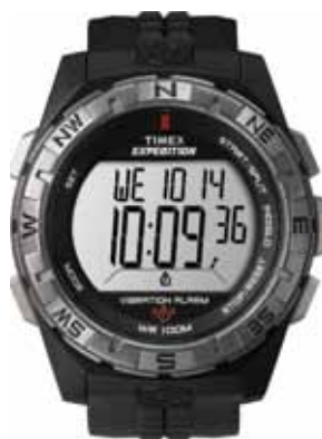
T49851 • $149.00