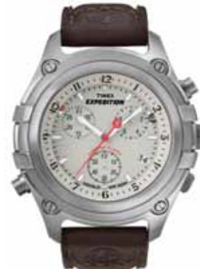
T49747 • $299.00