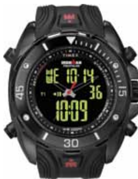
T5K405 • $249.00