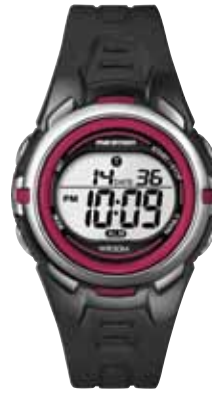
T5K363 • $79.00