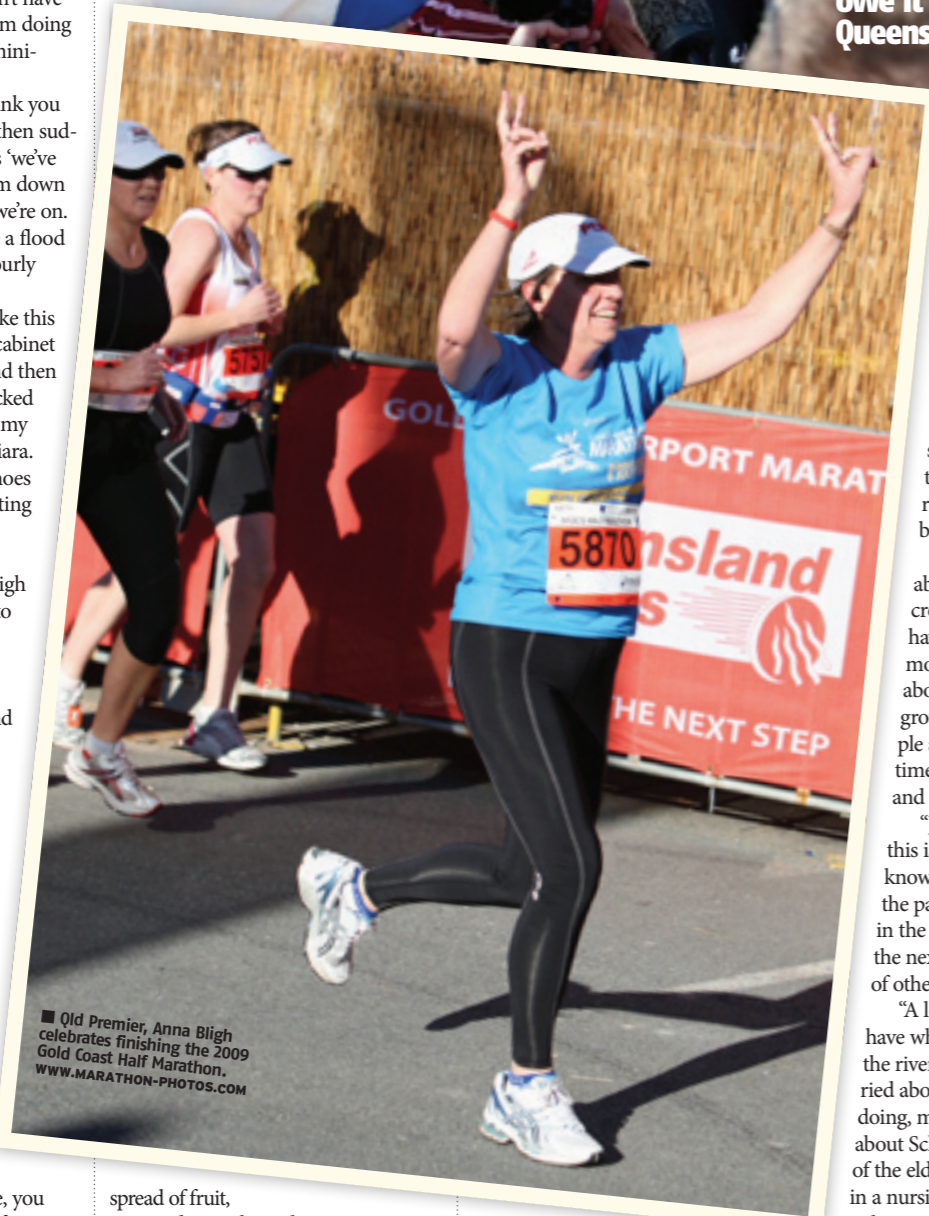
Qld Premier, Anna Bligh celebrates finishing the 2009 Gold Coast Half Marathon.

"It is a big job being Premier and it is a big state and you need a lot of energy to do it at the level I think it needs to be done and one of my answers is I couldn't do it without running... It's not a job that you can afford to be sick in, it's not a job that you can afford to be feeling a bit slow in. Some of the decisions I have to make, you really have to be at the peak of your performance. You owe it to the people of Queensland."